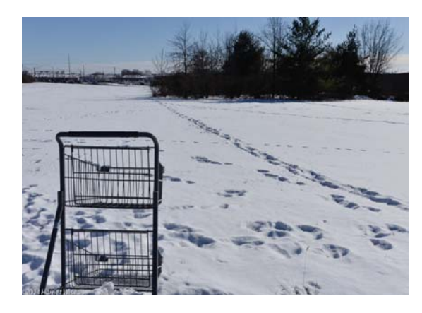
Outreach volunteers visit a camp site in Frederick, Maryland on January 29, 2014.