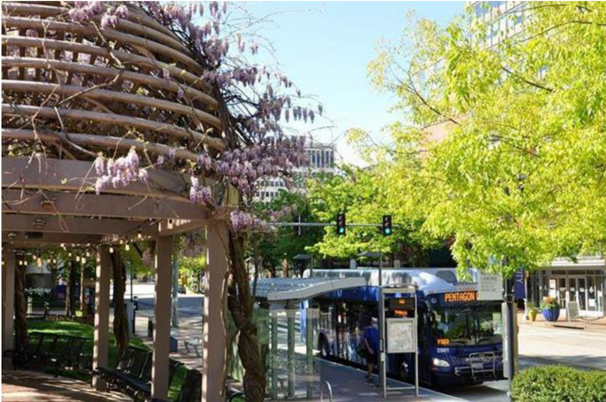
Crystal City Metroway BRT Stop in Arlington County, Virginia