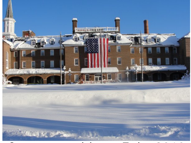
Snowmageddon - Feb. 2010