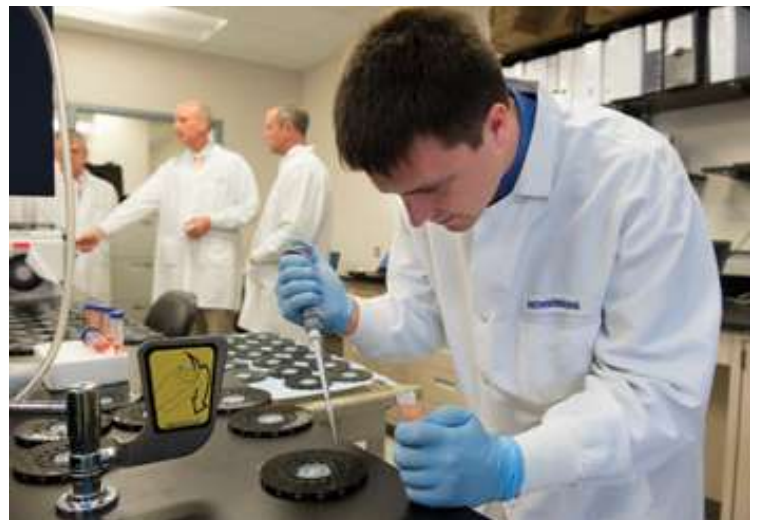
↓ University of Maryland BioPark

COG also conducted two analyses of real-time labor market data to better understand in-demand jobs and skills in the region. The Trends in Workforce Demand analyses found that half of the region's most in-demand occupations are computer-related positions. The second analysis focused on seven economic clusters with the potential to drive the region's