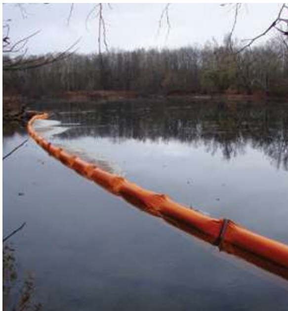
↓ Oil Boom on the Potomac River ( WSSC ).

In late November, an oil sheen was spilled on the Potomac River, and area water utilities took action to protect the region's drinking water. From the start of the spill response until the sheen was identified in early December, COG shared information and coordinated conference calls to ensure ongoing communication among the utilities. Following the incident, officials are revising the spill response plan to apply lessons learned. COG and the region's water utilities are also completing recommendations to increase the resiliency of their drinking water systems to further their ability to respond to risks to delivering safe drinking water.