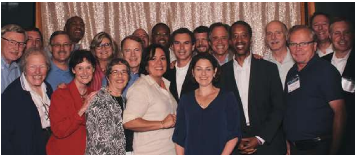
↓ COG Board Members at the Annual Leadership Retreat.