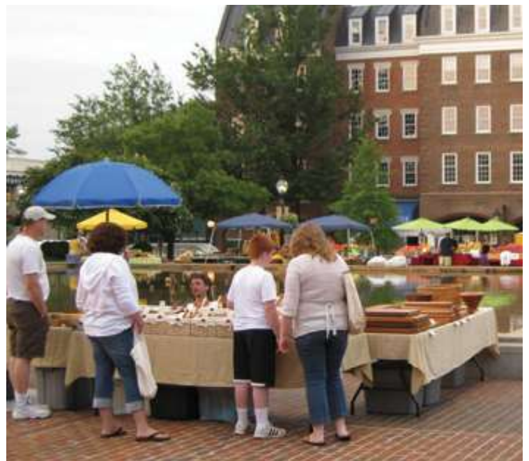
↓ Alexandria Farmer's Market.

In the spring, the U.S. Department of Agriculture's Know Your Farmer, Know Your Food program announced the participation of 10 regions in the FoodLINC initiative, which connects local farmers and their products with local consumers and businesses. Support is also provided from the Agua Fund, Prince Charitable Trusts, and the Town Creek foundation. Through a new coordinator building connections among farmers, distributors, and government officials, COG is leading the FoodLINC effort in metropolitan Washington, which is home to more than 12,000 farms.