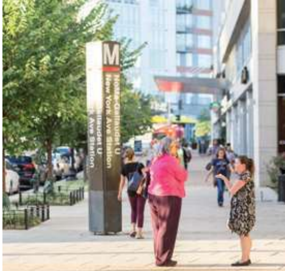
↑ Outside NoMa Metro Station

analyze performance metrics for Metro, funding needs, and the economic value of the system to the region. Following its initial analysis, the task force is studying new revenue options for Metro, which will be released in a forthcoming report in spring 2017.