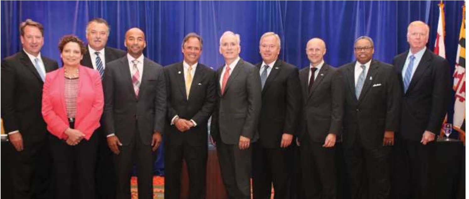
Speakers and officials at the June Metro forum.