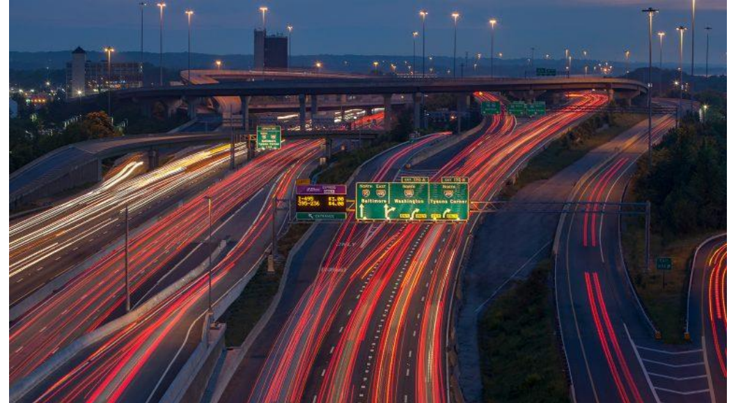
Timelapse shot of I-95