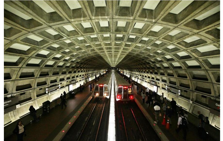
WMATA Gallery Place/Chinatown Station