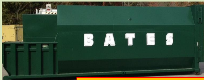
Food Waste Compactor