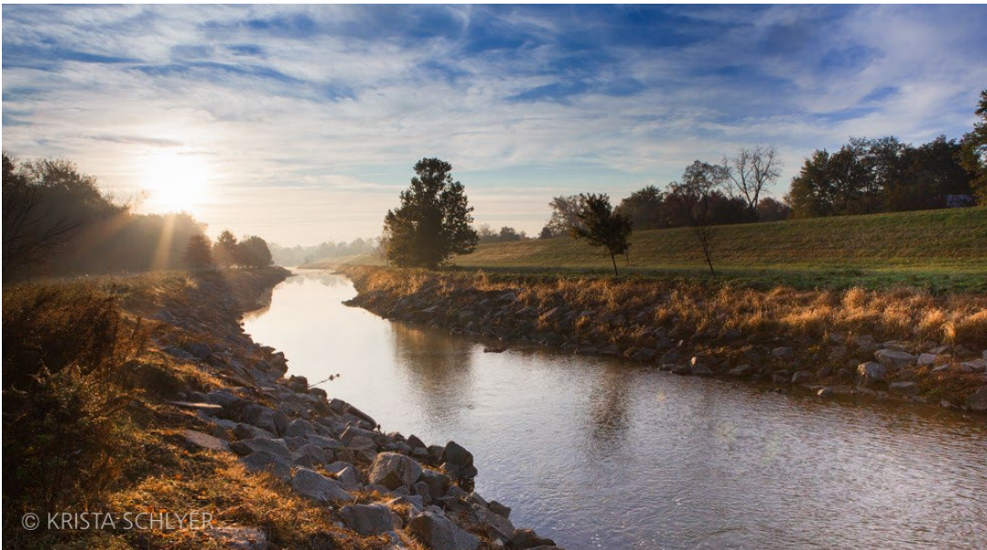
The Anacostia