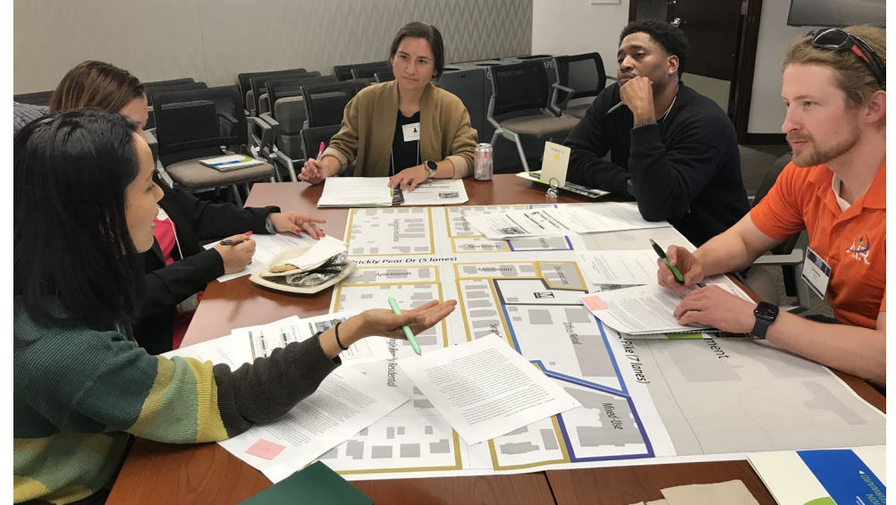
TPB Community Leadership Institute (COG)