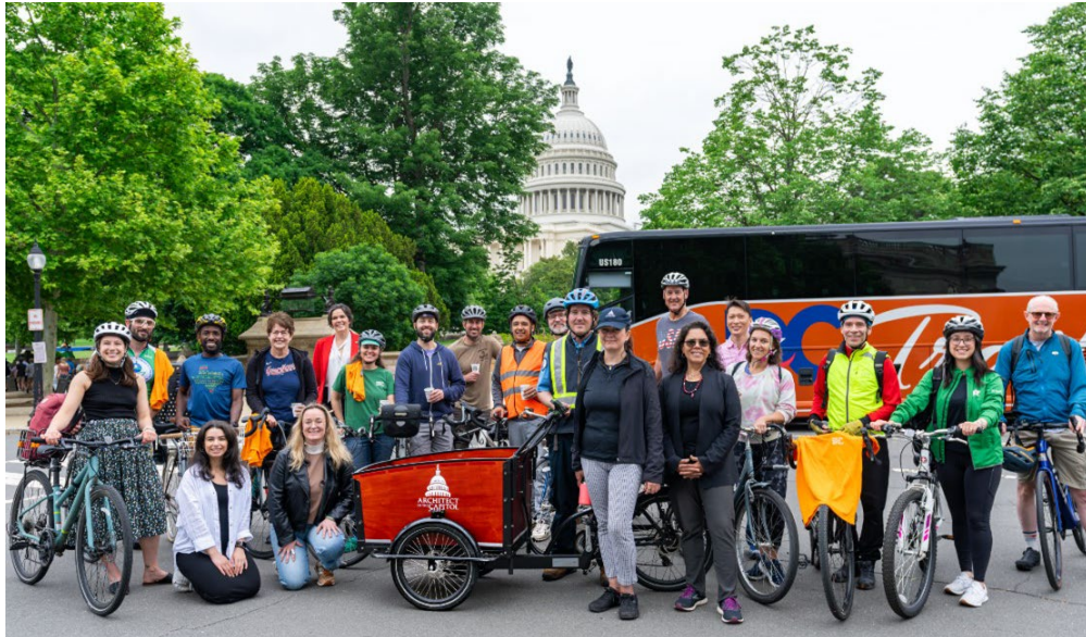
DC SW Capitol Hill at House Office Buildings pit stop