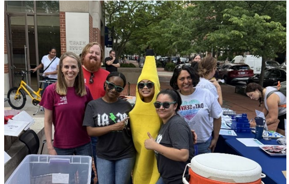
DC NW - West End American College of Cardiology pit stop