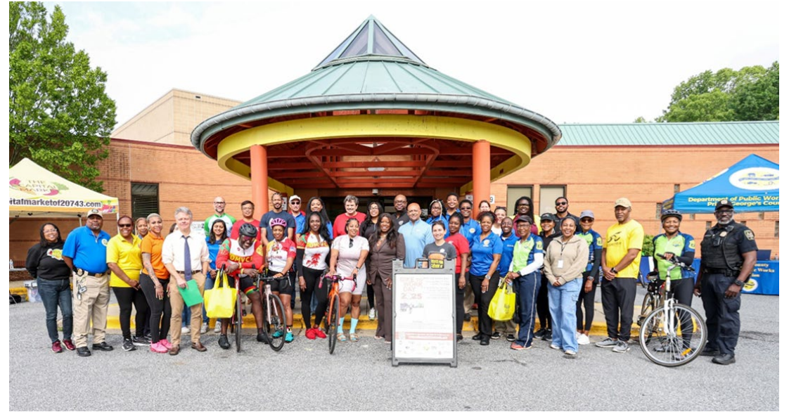
Prince George's County - Largo/Kettering/Perrywood pit stop