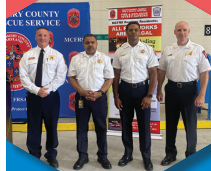
Public Safety Leadership Program graduates