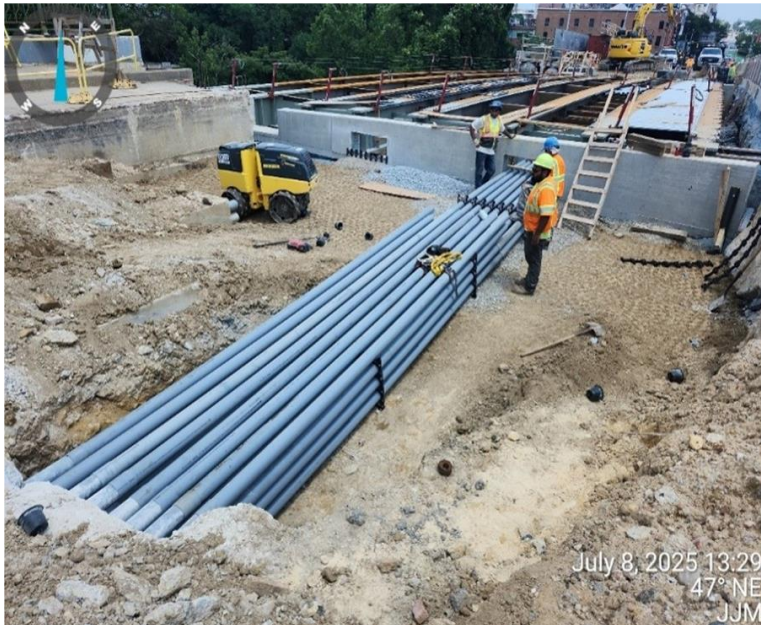
North Avenue Bridge