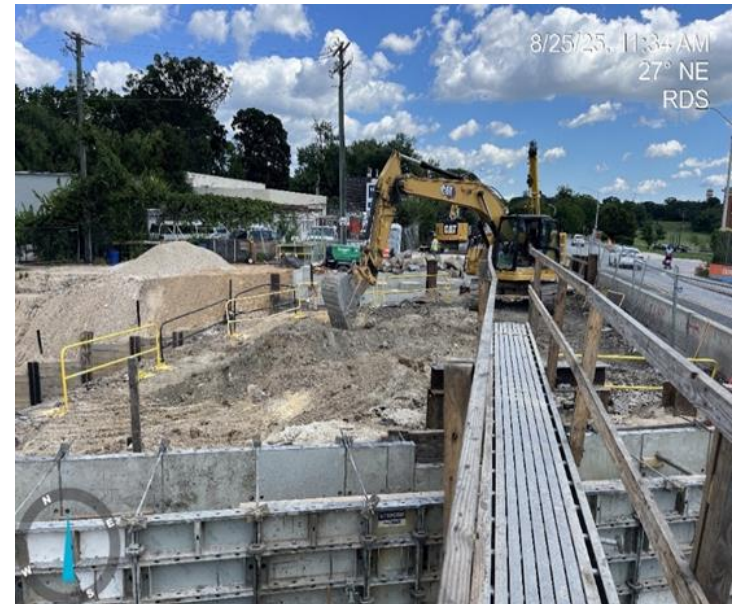
Harford Road Bridge