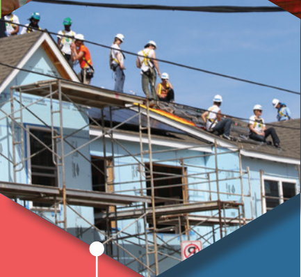
Solar Energy Goals