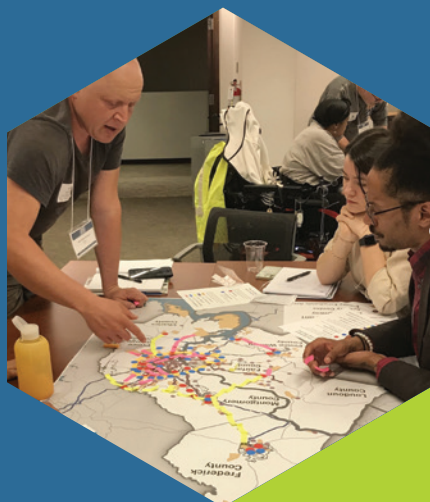
Community Leadership Institute