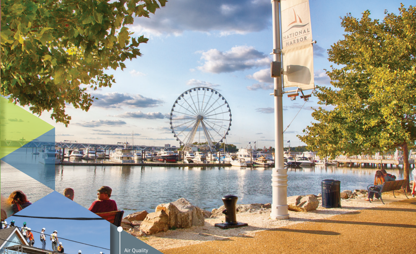
Air Quality Forecasts