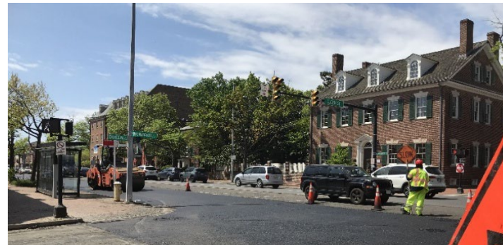
Street repaving in Alexandria, VA