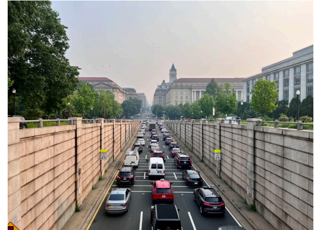
Traffic congestion on 12 street tunnel, downtown DC