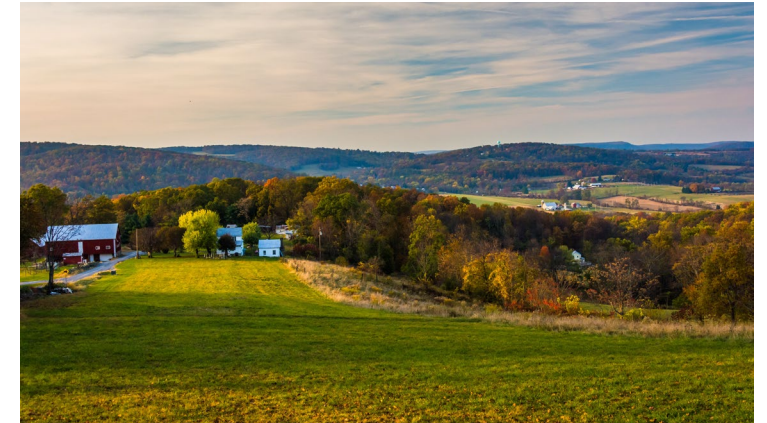
Farm pasture scene with house, barn, and mountains (COG stock)