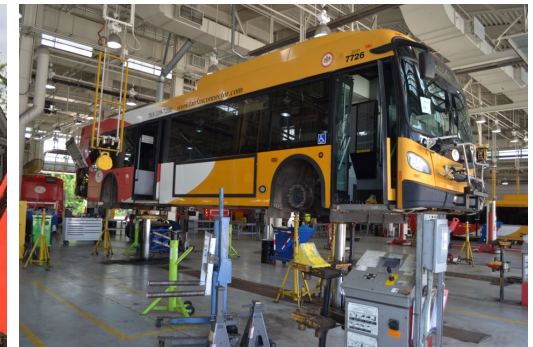
Fairfax Connector bus undergoing maintenance