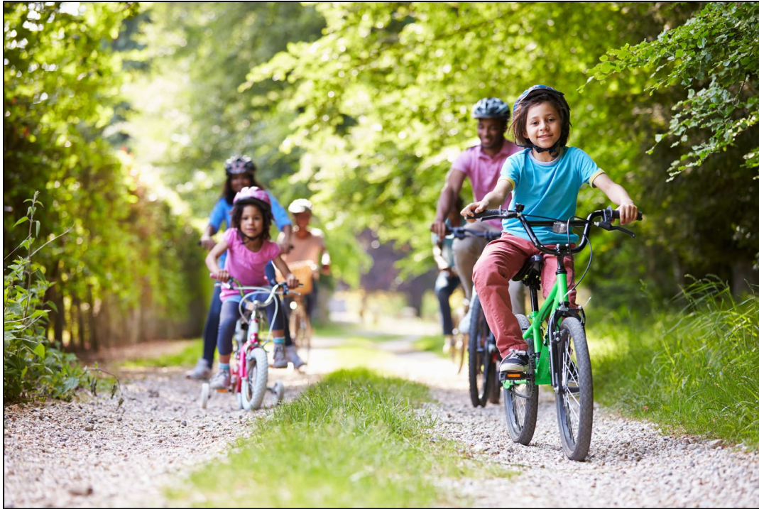
(Prince George's County)