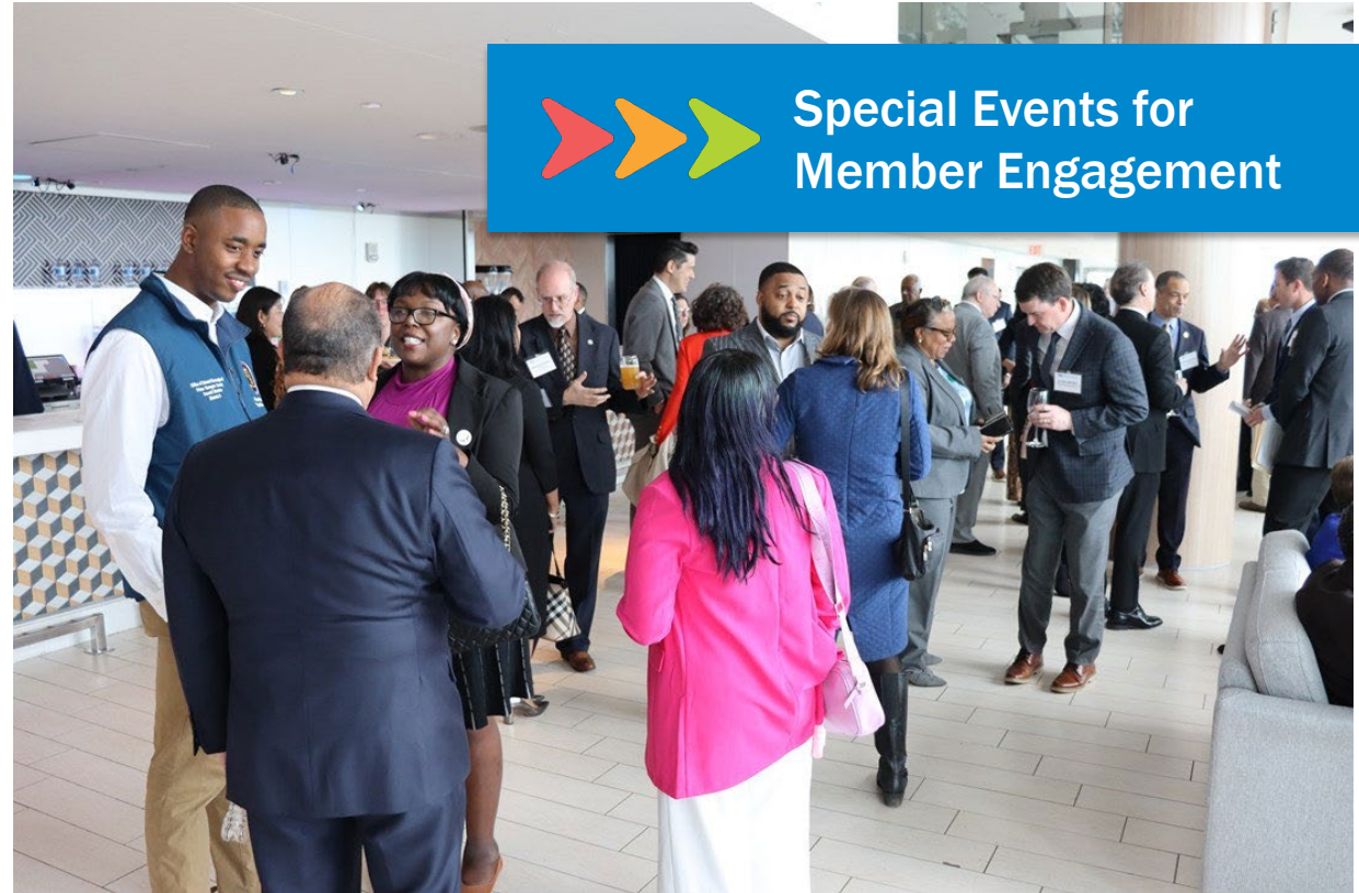
COG Capital Caucus 2025 – Event convening state legislators, local leaders