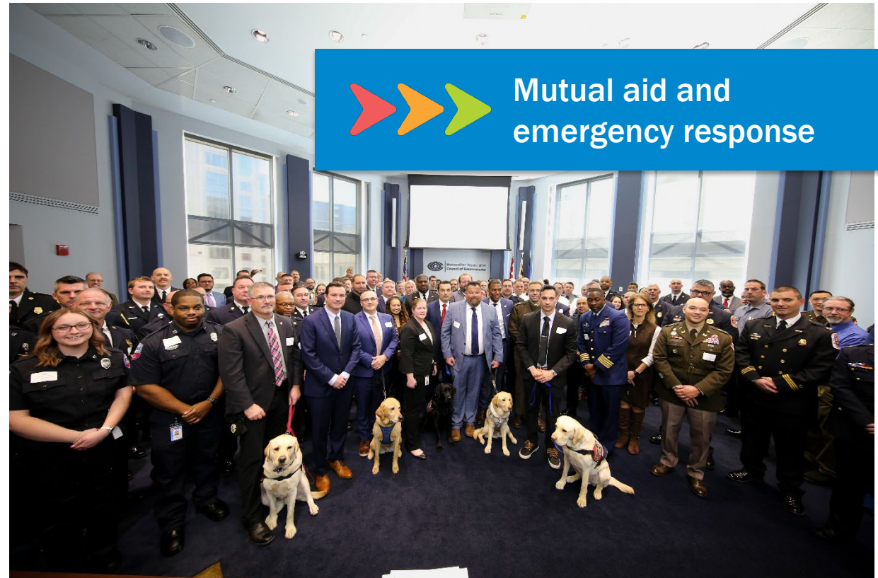
COG Board honors first responders for heroic efforts following mid-air collision