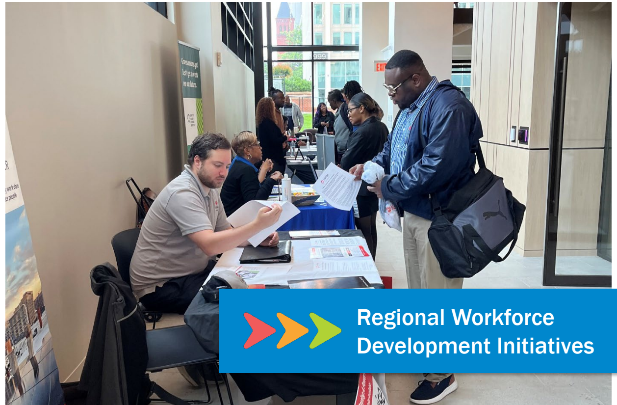
Job Fair by COG partner Greater Washington Region Clean Cities Coalition