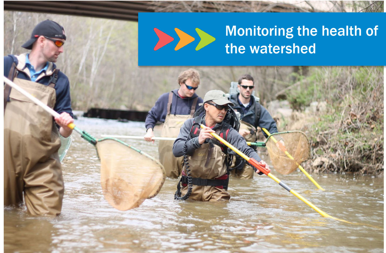
The Anacostia Watershed Restoration Project improves water quality, cleans up trash, supports fish and wildlife habitats, and creates opportunities for recreation and outdoor adventure.