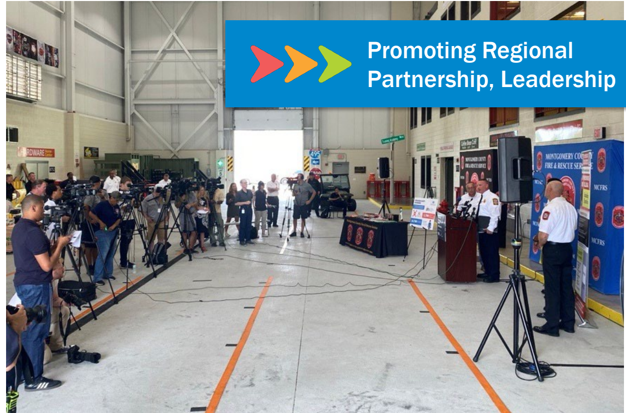
COG Fire Chiefs Fireworks Safety Press Conference – July 2025