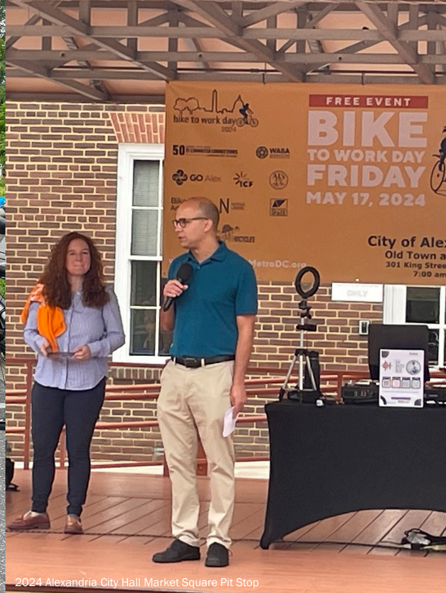
2024 Alexandria City Hall Market Square Pit Stop