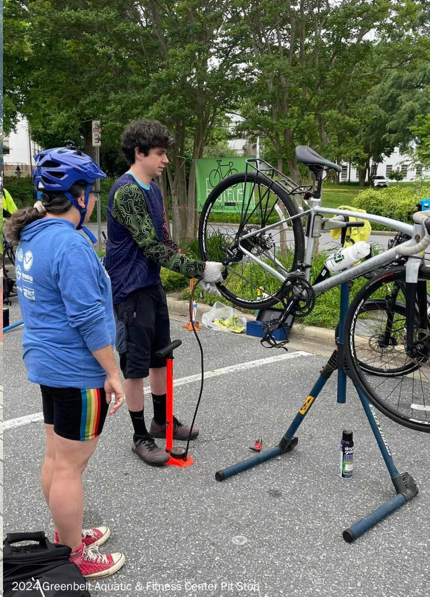
2024 Greenbelt Aquatic & Fitness Center Pit Stop