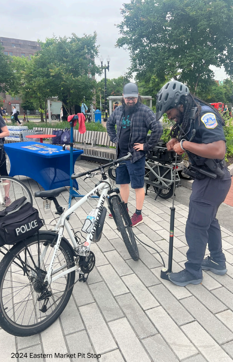
2024 Eastern Market Pit Stop