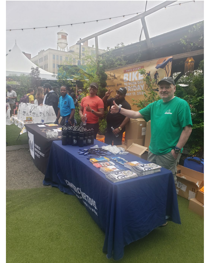
2024 NoMa Wunder Garten Pit Stop (NoMa)