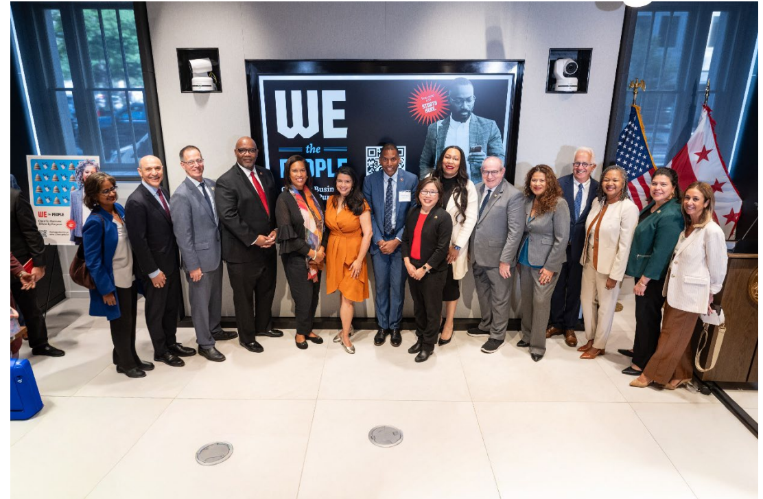
Talent Capital Launch – Regional workforce initiative spearheaded by COG and public, private, nonprofit, and high education sector partners.