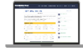
Online Commute Log Calendar