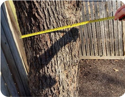
Mature Tree Preservation