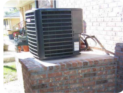
Elevate Exterior Utilities